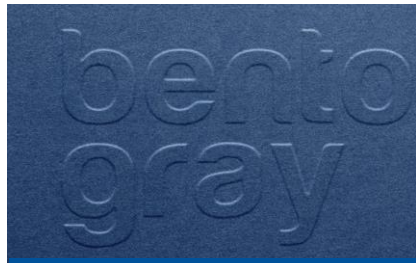
Emboss / Deboss